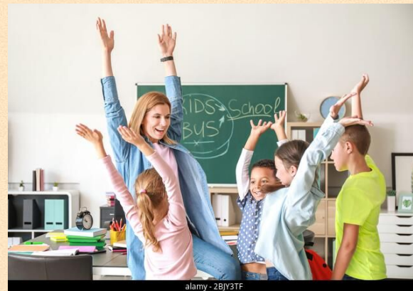
How it went!