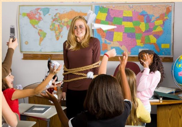
How it started.....